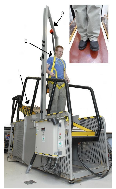
Figure 1 The ramp test

c. Test operators will be trained and verification will be undertaken prior to testing.